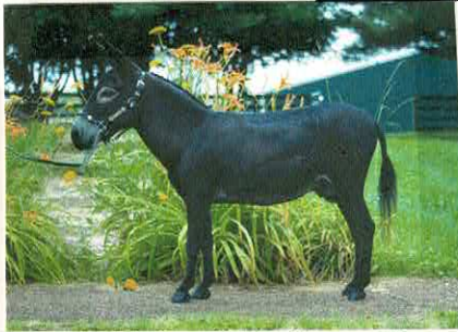
Parkside Special Delivery 2.jpg

The American Donkey and Mule Society. PO Box 1210, Lewisville TX 75067 www.lovelongears.com/ (972) 219-0781 The American Donkey and Mule Society is not responsible for errors in information submitted to the registry.