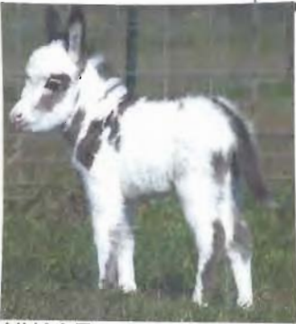
HHA Tramp Stamp 2.jpg

The American Donkey & Mule Soc PO Box 1210 Lewisville TX 75067 (972) 219-0781 www.lovelongears.com