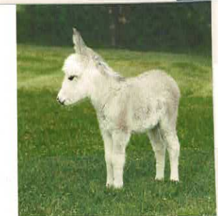
HHAA Sugar Coat (Shug) 2

The American Donkey and Mule Society, PO Box 1210, Lewisville TX 75067 www.lovelongears.com/ (972) 219-0781 The American Donkey and Mule Society is not responsible for errors in information submitted to the registry.