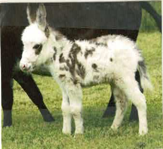
HHAA Shivers 2.jpg

The American Donkey and Mule Society, PO Box 1210, Lewisville TX 75067 www.lovelongears.com/ (972) 219-0781 The American Donkey and Mule Society is not responsible for errors in information submitted to the registry.