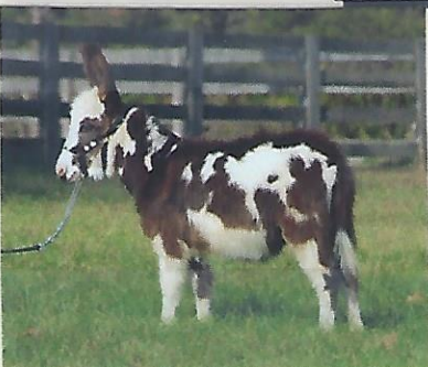
HHAA Goosebumps 2.jpg

The American Donkey and Mule Society P.O. Box 1210, Lewisville, TX 75067 (972) 219-0781 The American Donkey and Mule Society is not responsible for errors in information submitted to the registry.