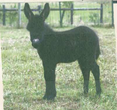
HHAA Dream of Genie 2.jpg

The American Donkey and Mule Society, PO Box 1210, Lewisville TX 75067 www.lovelongears.com/ (972) 219-0781 The American Donkey and Mule Society is not responsible for errors in information submitted to the registry.