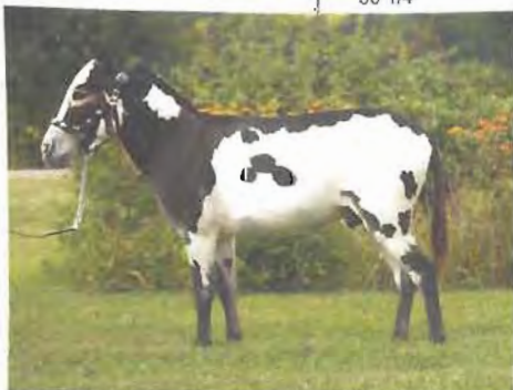
BAF Half Ass Acres Pow Wow 2.jpg