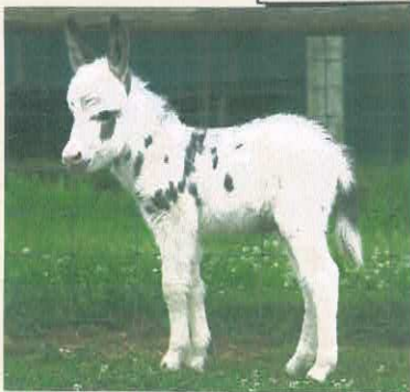
HHAA Alphabet Zoup 2.jpg